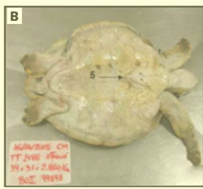
Figure 1 - Chelonia 1 (A) Dorsal view; at the tip of arrows 1 and 2 a diminution of the width of the limb can be seen, 3, there is injury by cutting material and 4, identification plate of the Tamar Project. (B) Ventral view; in arrow 5 is noticed the bone exposure because of the high degree of cachexia.