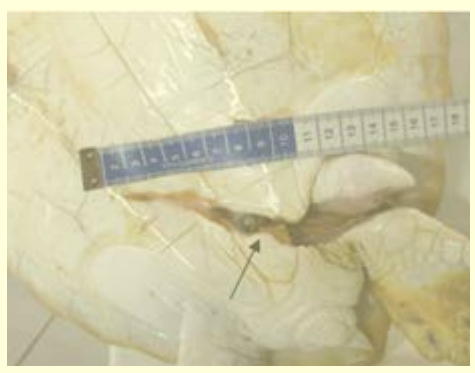
Figure 2 - Chelonia 5 Chop wound lesion with 15 cm in length.